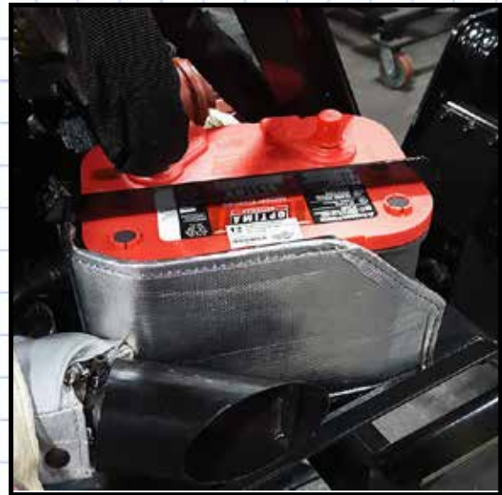
This heat shield protects the battery in a diesel engine compartment.